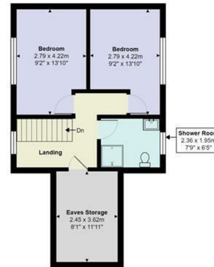
First Floor Area: 45.6 m 2 ... 490 ft 2