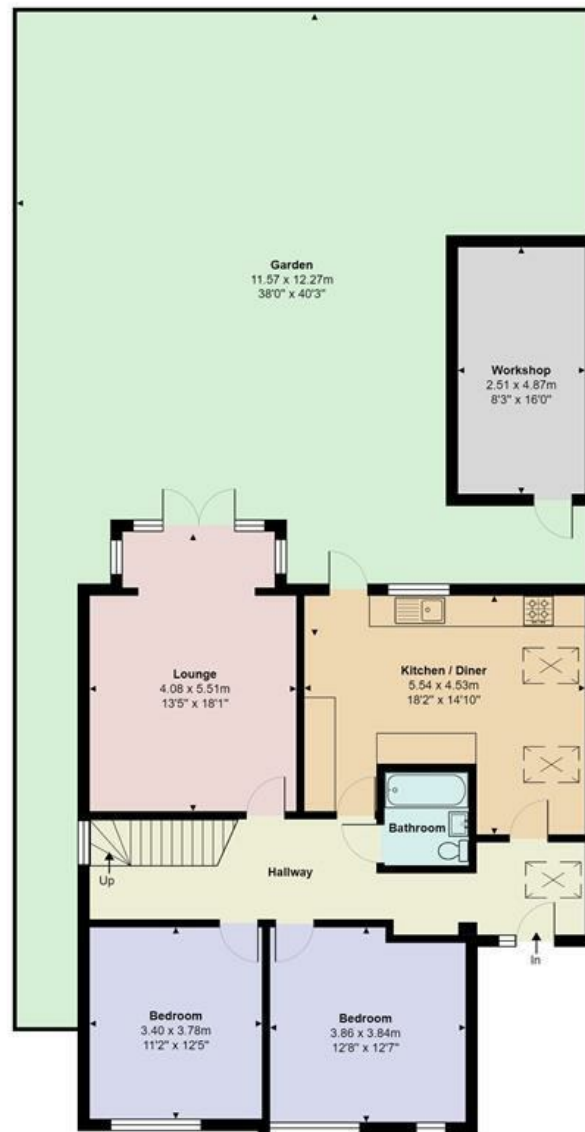
Ground Floor Area: 108.7 m 2 ... 1170 ft 2